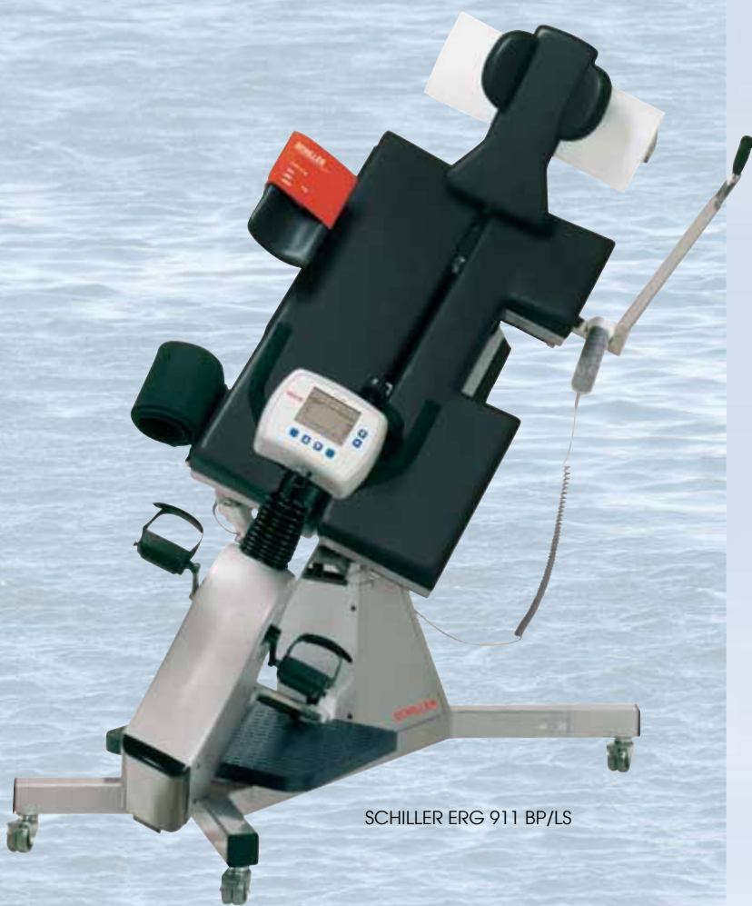
SCHILLER ERG 911 BP/LS

The use of an exercise echocardiography couch is also recommended for the examination of elderly and handicapped patients.