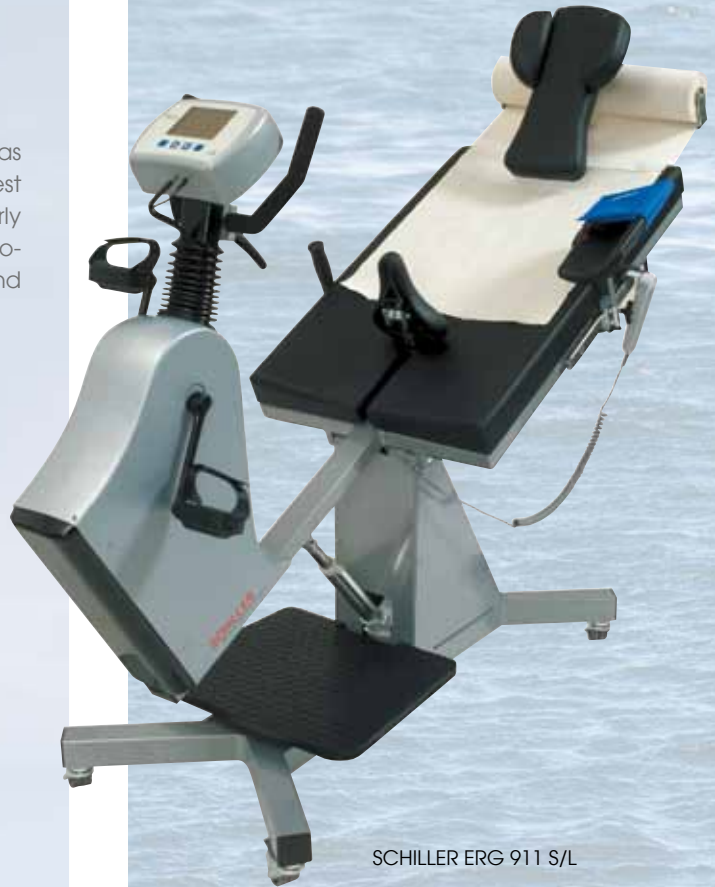
SCHILLER ERG 911 S/L

The new SCHILLER couch/semi-couch safety ergometer has been developed and manufactured according to the latest European directives for medical ergometers. It is particularly suitable for exercise and cardiac catheter tests in cardiology and rehabilitation, as well as for high-risk patients and elderly or handicapped people.